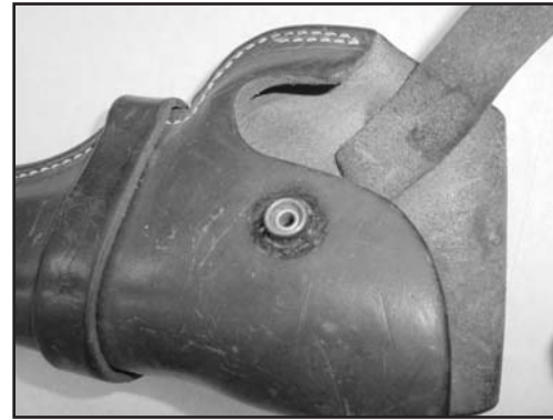
Verdigris is often found on the brass snaps of firearm's holsters. Does it hurt the leather?