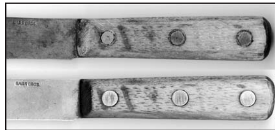
Verdigris has formed around the brass rivets of this old Barr Bros knife. When the verdigris was removed, the knife was like new again.

And then there was this nagging problem of doing this article in a black and white publication. I mean lovely to look at green stands out in colour but in gray on gray and black and white it doesn’t quite make the point. So for this article, please let your green colour imagination go to work for you.