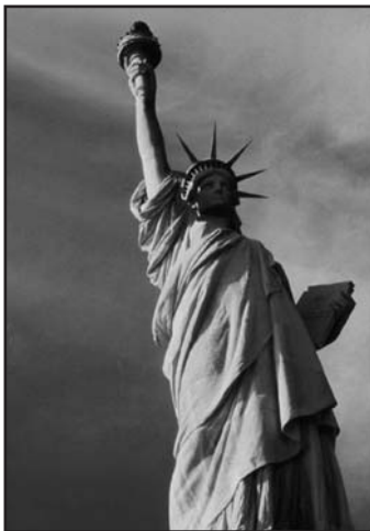
The green patina on the Statue of Liberty is verdigris.